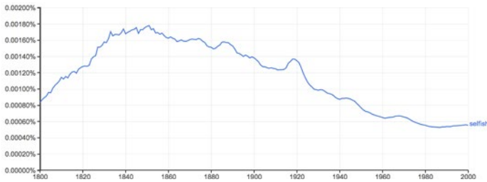
Figure 0.1 Graph of trends in usage of ‘selfish’, 1708–2008.

of self, which leads a man to connect everything with himself and to prefer himself above everything in the world’. ‘Individualism’, he believed, ‘disposes each member of the community to sever himself off from the mass of his fellows and to draw apart with his family and friends so that he . . . willingly abandons society at large to itself’ ([1840] 1990: 98).