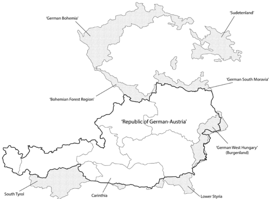
Map 0.4. Territories claimed by 'German-Austria' ( Deutsch-Österreich ) in 1918/19. Created by Sebastian Sillinger. Used with permission.