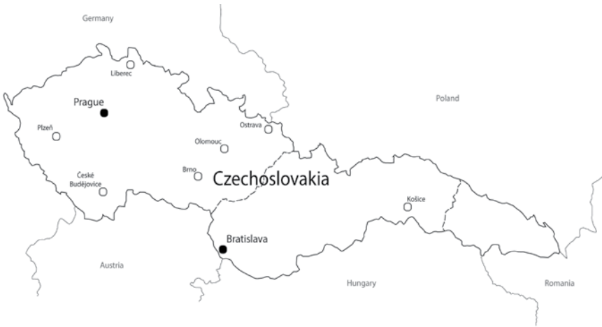
Map 0.3. The First Czechoslovak Republic. Created by Sebastian Sillinger. Used with permission.