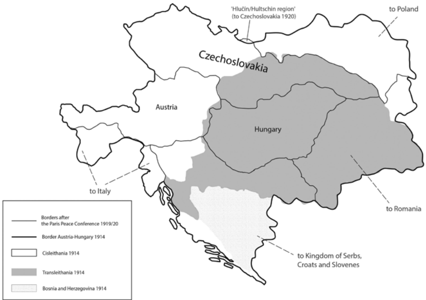
Map 0.1. The successor states of the Habsburg Monarchy.